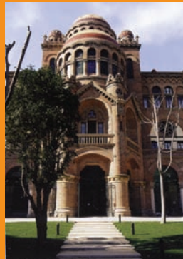
Fundació Doctor Robert UAB